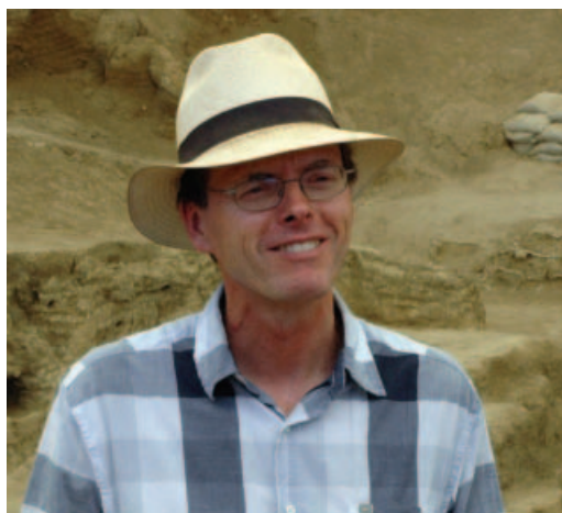
Fig. 3. Ian Hodder at Çatalhöyük in 2006.

IH: In this and the last question you are showing yourselves to be rather Eeyore-like! I take a much more up-beat view than you do. Maybe that is because I now work in an anthropological context in which I see lots of people drawn to archaeology and to its theories. Those archaeologists working on materiality, the body, constructions of history, agency, the long-term and so on are definitely being read outside the discipline. New approaches to and theories about heritage are producing lively interdisciplinary debate. Cognitive and evolutionary anthropologists and psychologists are drawn to archaeology as are linguists and artists. Just as one small example, over the past two years we have brought the same group of eminent anthropologists, theologians and philosophers to spend five days at Çatalhöyük (funded by the Templeton Foundation), learning about what we do, helping us interpret ‘at the trowel’s edge’.