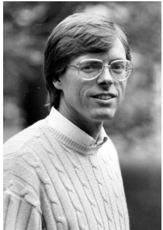
Fig. 1. Ian Hodder in the courtyard in front of the archaeological department in Cambridge in the mid 1980s.

IH: In my own reading of the Clarke and Binford & Binford books, I did not see any direct link to the radicalism of the time. It was clear that political engagement would have to be separate from the learning of, and