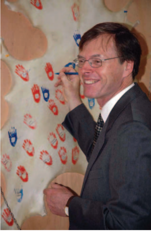
Fig. 2. Ian Hodder signing a panel at an exhibit about Çatalhöyük in Istanbul in 2006.

IH: It is not easy to explain why the processual/post-processual archaeology debate took such a different course in the US. Partly, of course, there was the very fact that it was a British initiative! But an important factor was undoubtedly that American archaeology had split itself off from the interpretivist developments in American cultural anthropology. American archaeology was thus cut off from the types of writers and influences that might have produced an interpretive turn in American archaeology. American archaeology stayed lodged in an older evolutionary and positivist paradigm. Also extremely important was that the New Archaeology had been hard fought. It was seen as a battle that many had invested in. There was a great expansion of archaeology in US universities in the 1960s and 1970s.